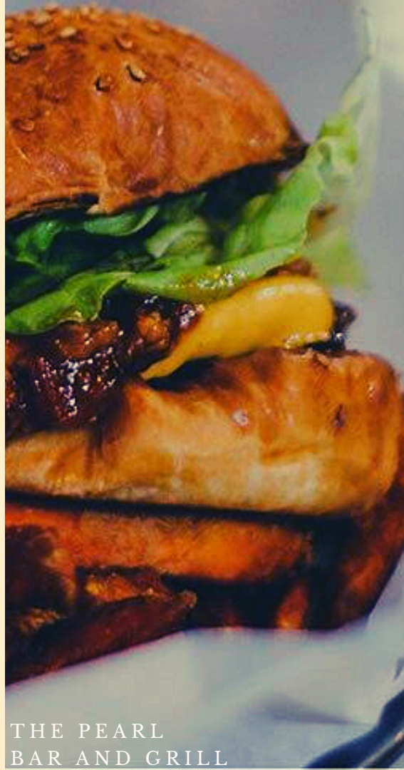
THE PEARL BAR AND GRILL