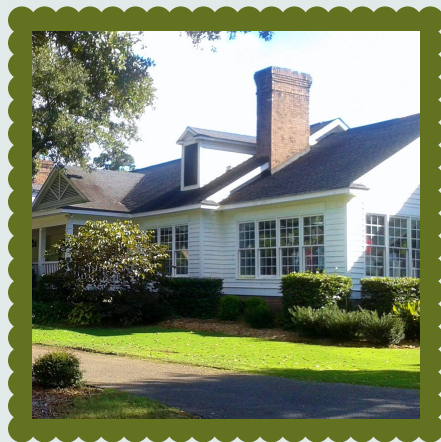
BLACKMOOR GOLF CLUB