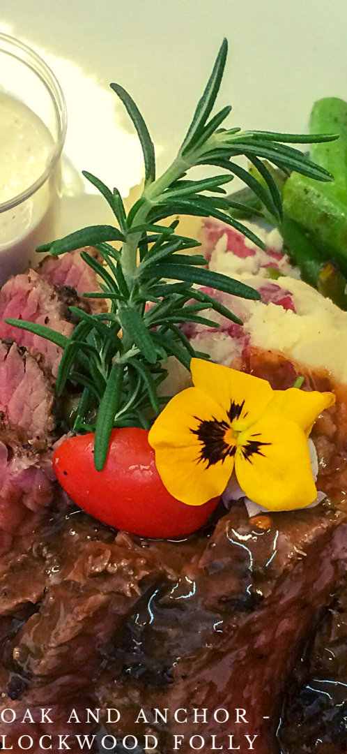
OAK AND ANCHOR - LOCKWOOD FOLLY